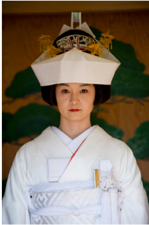
The tsunokakoshi, a Japanese bridal hat. The hat is considered traditional but is more recent than the watabōshi, another form of headwear that covers more of the face. Both indicate the bride's resolve to become an obedient wife—the veiling of the head represents the masking of traits such as jealousy and selfishness.

When questioned as to their motivation for wearing uchikake, many brides stress both its intrinsically Japanese ( nihon-teki ) and traditional ( dentō-teki ) aspects as reasons for deciding to include it instead of wearing a Western dress alone. It is important to note, however, that the uchikake did not become part of the traditional bridal attire worn by most brides until the late 1960s, when the wedding industry began its boom period. Before that, only a very few brides, who could afford to follow what had been known as part of the ceremonial court protocol, wore it. Moreover, the contemporary image of white weddings is promoted by the wedding industry as traditionally Japanese in promotional captions, such as “Wear your hair in the traditional Japanese wedding style, put on a pure white kimono ( shiro muku ), take the oath of marriage.” However, some researchers of Japanese custom instead view all this as a later development based on the white wedding gown worn in the West.