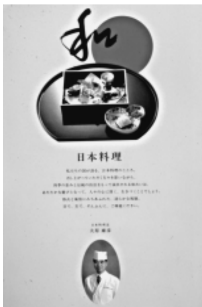
FIGURE 1 Japanese cuisine presented by the calligraphy of wa (Japanese) painted on the eternal Japanese sun

names of the Japanese menus on offer. These, do not only always appear in Chinese characters, but are also closely related to Japanese tradition, in titles such as kagura that stands for sacred (Shinto) music and dancing and utai , meaning chanting of a no drama text.