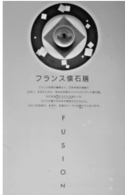
FIGURE 2 'Fusion' – the French–Japanese combination

The food presentation in the 'original ( orijinaru ) Meiji Kaikan Furansu Kaiseiki' is more daring than the usual. Japanese-style lacquer boxes and even the characteristic Japanese-style tray are not used at all. Moreover, while most dishes are separated into distinct Japanese and