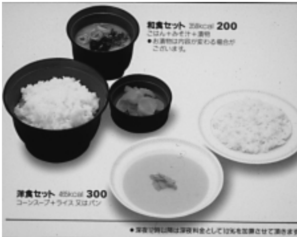
FIGURE 4 Japanese and Western 'sets' in their proper containers

a deep understanding of the foreign world. A careful look at many of the 'grand-menus', as one of these restaurants carrying the name Gusto describes their typical oversized pictorial menu, shows an over-use of English titles. This is true both for the categories, such as 'Morning and Healthy', 'Dessert and Drink' or 'Kids' ( kizzu ) and for the names of