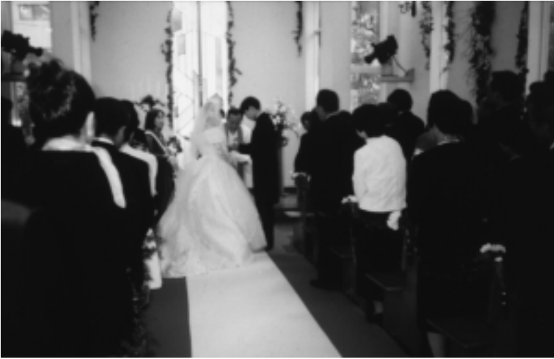
FIGURE 5 Until the early 1990s over 90 per cent of the Japanese had a Shinto service

Now that chapel weddings have become very popular, the distinction between a Japanese attire for a shrine and a Western dress for a chapel has become unmistakable. A leading parlor manager assured me in an interview that there are no cases in his experience of Japanese attire being worn in a chapel. He also emphasized the seeming clash between