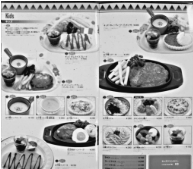
FIGURE 3 Kids ‘international’ menu in one of the popular family restaurants

The distinction between Japanese and Western food styles is paradoxically well observed in places that have a Western or international image such as popular family restaurant chains. These ‘American’-style restaurants usually carry foreign names typically written only in roman letters. Names such as Royal Host, Volks and Joyfull are not always intelligible in English or any other foreign language, but serve the role of giving the impression – which is often false (Creighton, 1995: 156) – of