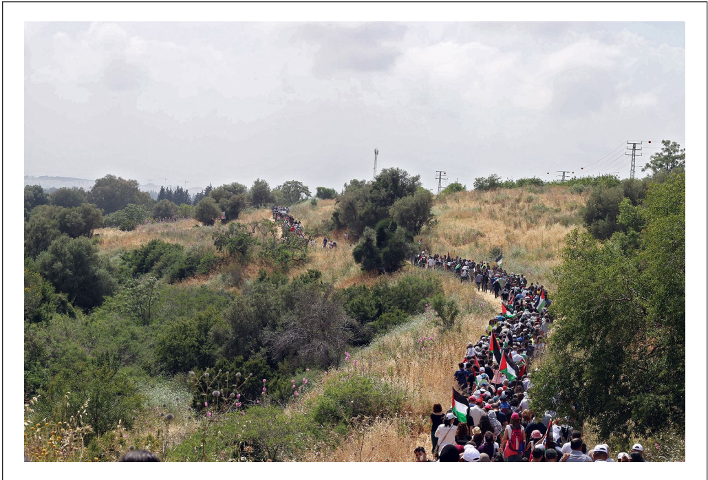
Image 2. March of Return to al-Kabri village, May 2, 2017.

Fourth, other practices have been largely symbolic but no less important. This includes, foremost, memory practices that perform an active refusal to forget the foundational violence in the Nakba and to assert the continuity of Palestinian baqa'a (remaining in the home/land). Palestinians have practiced symbolic return to destroyed villages or, for younger generations, those of their ancestors (see Image 2 of a return march). In the first years of military rule, Palestinians visited/temporarily returned to depopulated villages on Israeli Independence Day, the only day they were permitted to move without permits. In the wake of the Kufr Qassem massacre in 1956, the Land Day commemoration in 1976 took off as a popular practice of social protest against domination, conspicuously refusing the erasure of the state's constitutive violence from Palestinian and Israeli consciousness (Ghanem and Mustafa 2018; Sorek 2015).