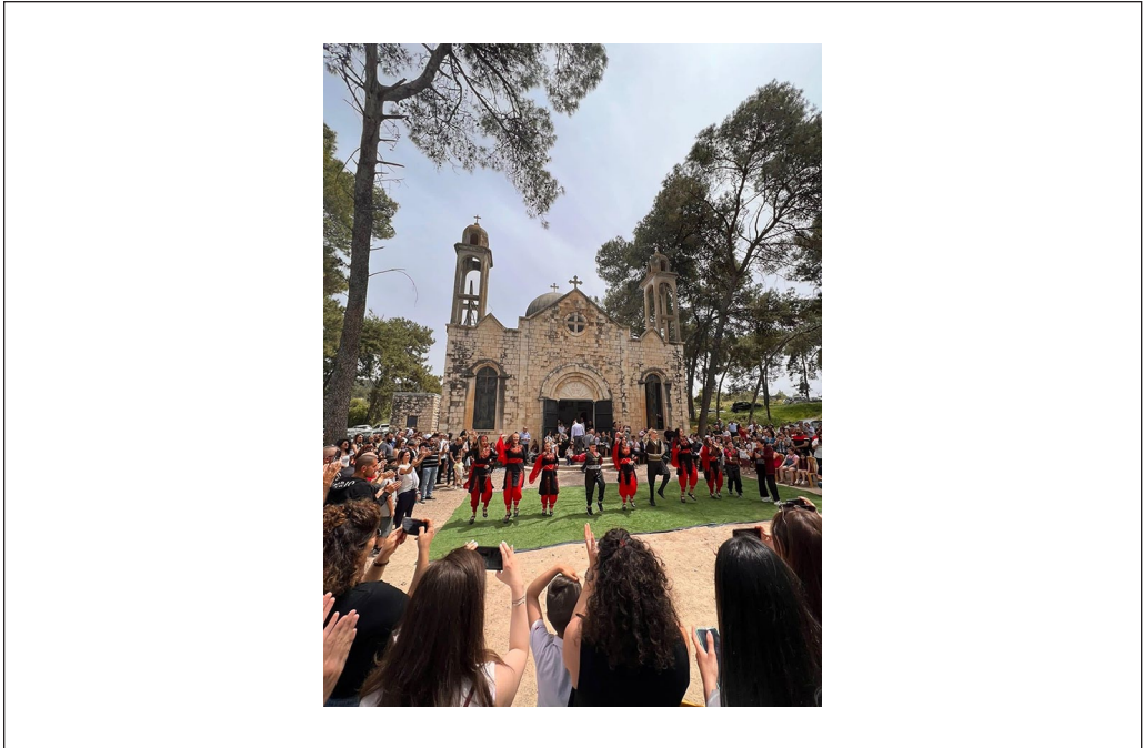
Image 1. Easter celebration at the church of displaced village Ma'alul, April 18, 2022.

restrictions remained unresolved. Israeli governments continuously rejected the IDPs' ability to return out of "security-factor justifications," citing the potential precedent any permission to return would bring and the unrest it would foment among other Palestinians (Kimmerling 1977:163–64).