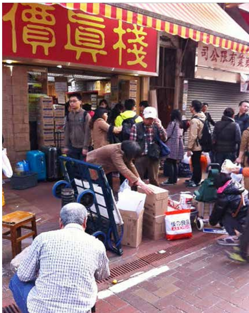
Photograph taken by the author, February 2015

As a result of public pressure, in 2013 Hong Kong's government decided to allow only two boxes of milk powder to be carried across the border from Hong Kong into mainland China. Thus, in the summer of 2013 large signs appeared around the immigration checkpoint in Luo Wu on the way to the mainland Chinese border, stating that people could not bring heavy luggage or more than two boxes of milk powder into China. In the winter of 2015, protests against mainland visitors and traders intensified and