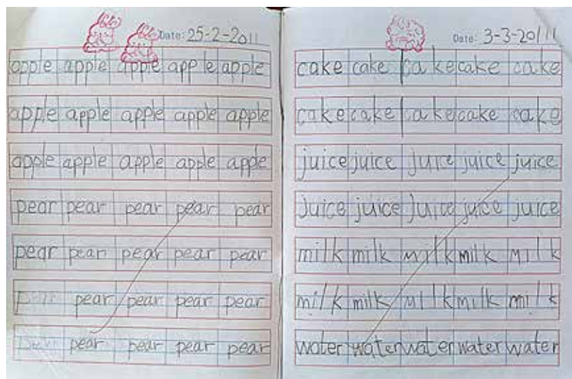
Figure 4.3 My daughter's English homework at the kindergarten

English, and mathematics. The children also had art and sports lessons twice a week. The kindergarten schedule was dedicated to studying the different subjects, and between classes they received a snack and a thirty-minute break for playing inside the classroom. The school year was divided into two semesters; in the beginning of each semester the children received books and notebooks to accompany their studies. Every day, the children were assigned homework which included writing numbers, practicing Chinese characters, and learning new words in English. The teacher graded the homework and each child received one, two, or three stamps according to how well they did. Twice a week the children had dictations in English and Chinese, and they received number grades.