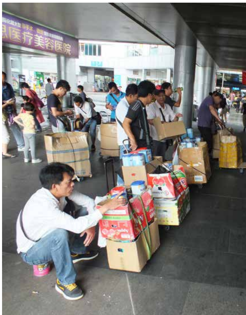
Figure 2.3 Mainland traders at the Shenzhen train station selling Hong Kong commodities

Photograph taken by the author, July 2013