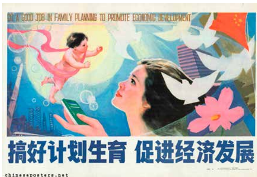
Figure 4.2 'Do a Good Job in Family Planning to Promote Economic Development'