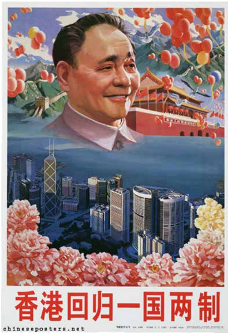
Figure 1.1 Hong Kong returns to Chinese sovereignty propaganda poster