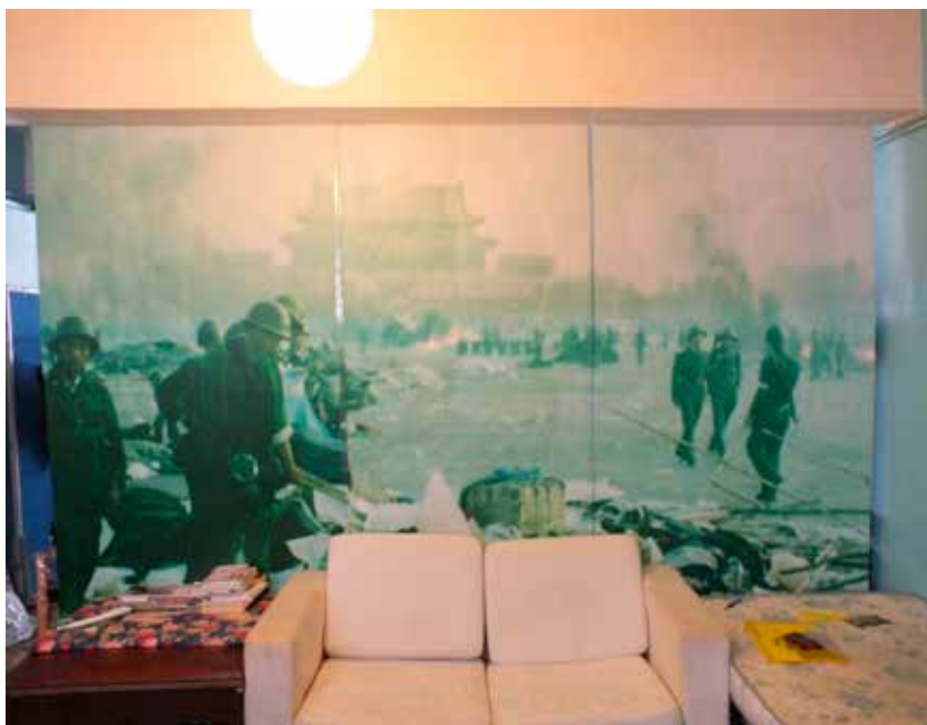
Figure 5.1 The poster of the Tiananmen demonstrations' outcome in the artists' apartment at Woofer Ten

Photograph taken by the author, July 2013