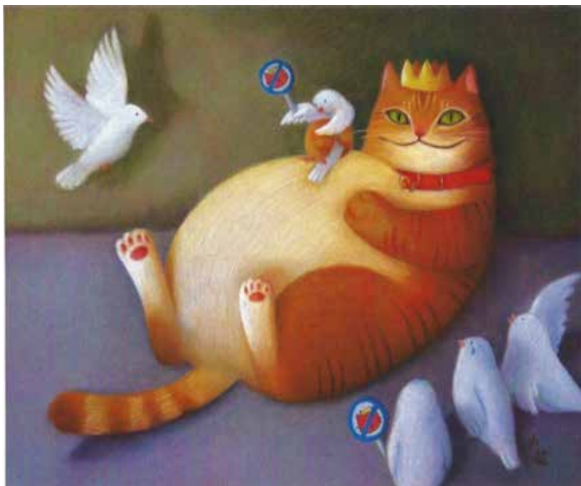
Painting by the artist Xiao Hua

pardon me for being straightforward, but I believe that art resources should be challenged to the resistance in real. Since this is not possible in this occasion, I didn't have much interest taking part in the project. For personally, I am just too poor and strained in life, obsessed with the local, and a farming existence [...] Art (or even the good-hearted) has really too little to offer to all the different locally meaningful resistance, while having the danger of drawing away the tiny bits of the precious resources which are needed or should be reserved for a longer sustainable resisting survival. (Hanina gallery, 2013)