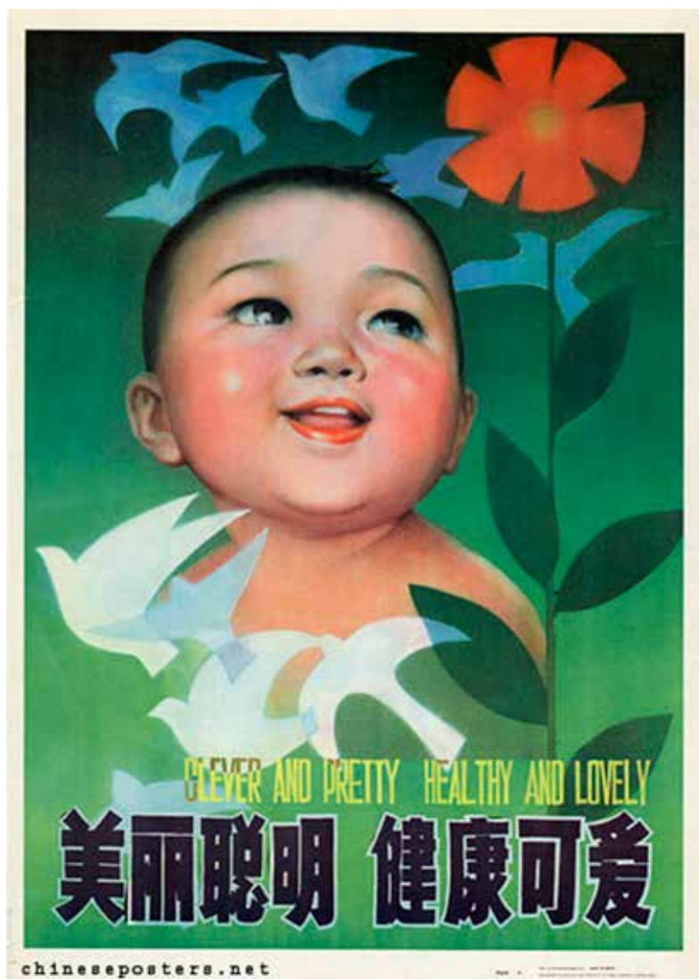
Figure 4.1 'Clever and pretty, healthy and lovely'